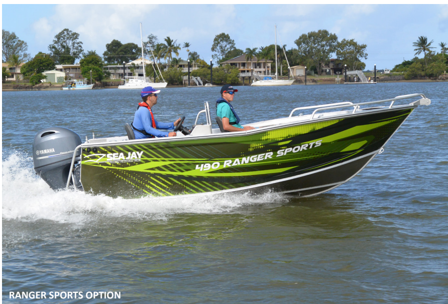
RANGER SPORTS OPTION