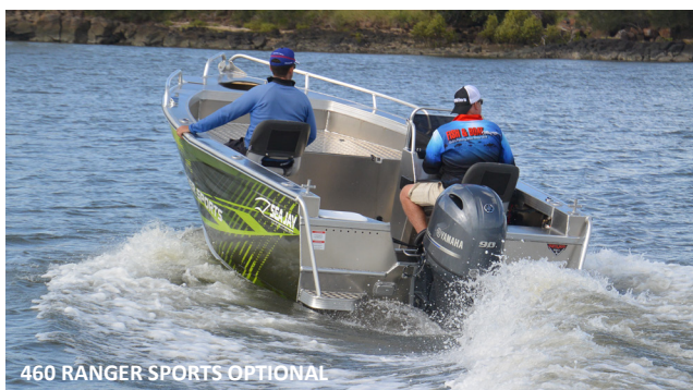
460 RANGER SPORTS OPTIONAL